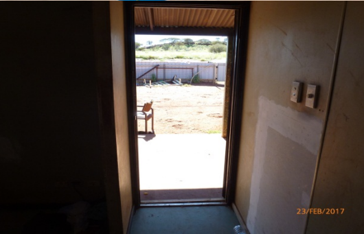
Front door missing

A few common house hygiene issue's We come across