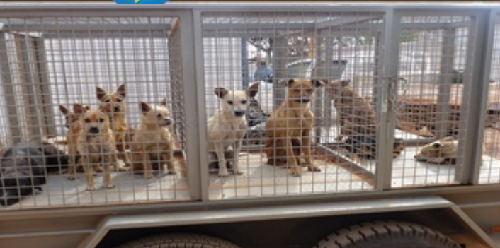
Dogs in dog cage waiting for de-sexing Expensive machinery and lengthy time