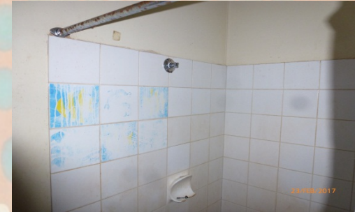
Missing shower roses And broke soap holders

A few common house hygiene issue's We come across