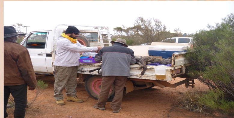
On the spot de-sexing no expensive Delicate machinery