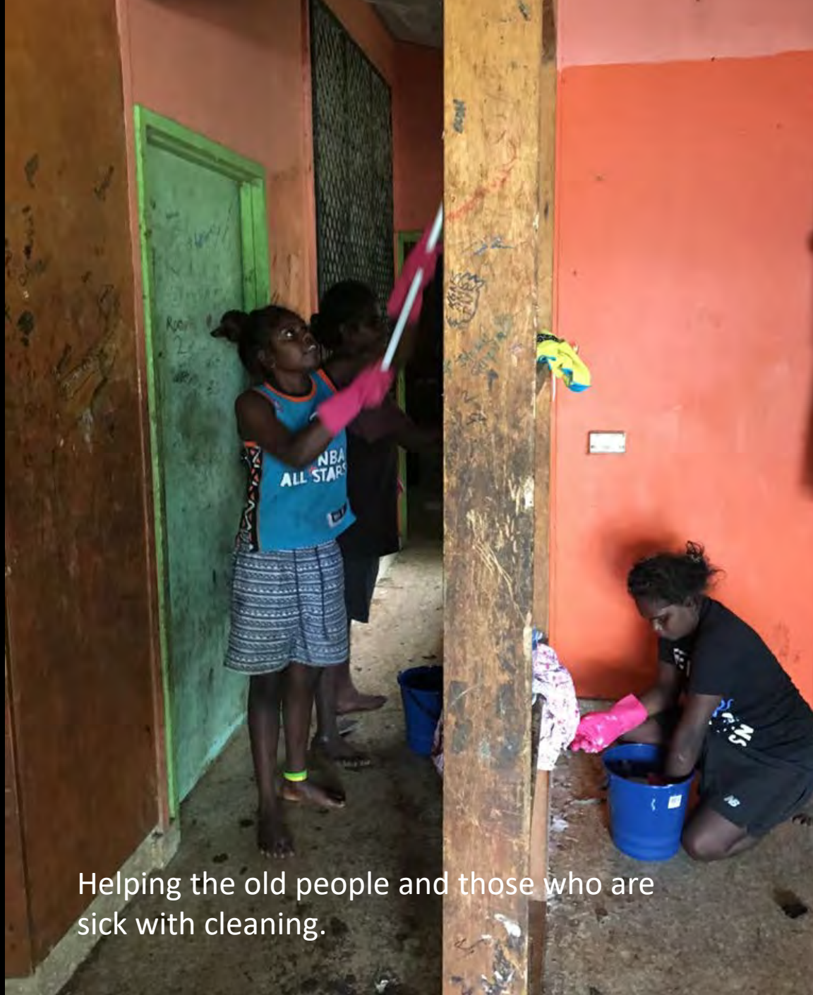
Helping the old people and those who are sick with cleaning.