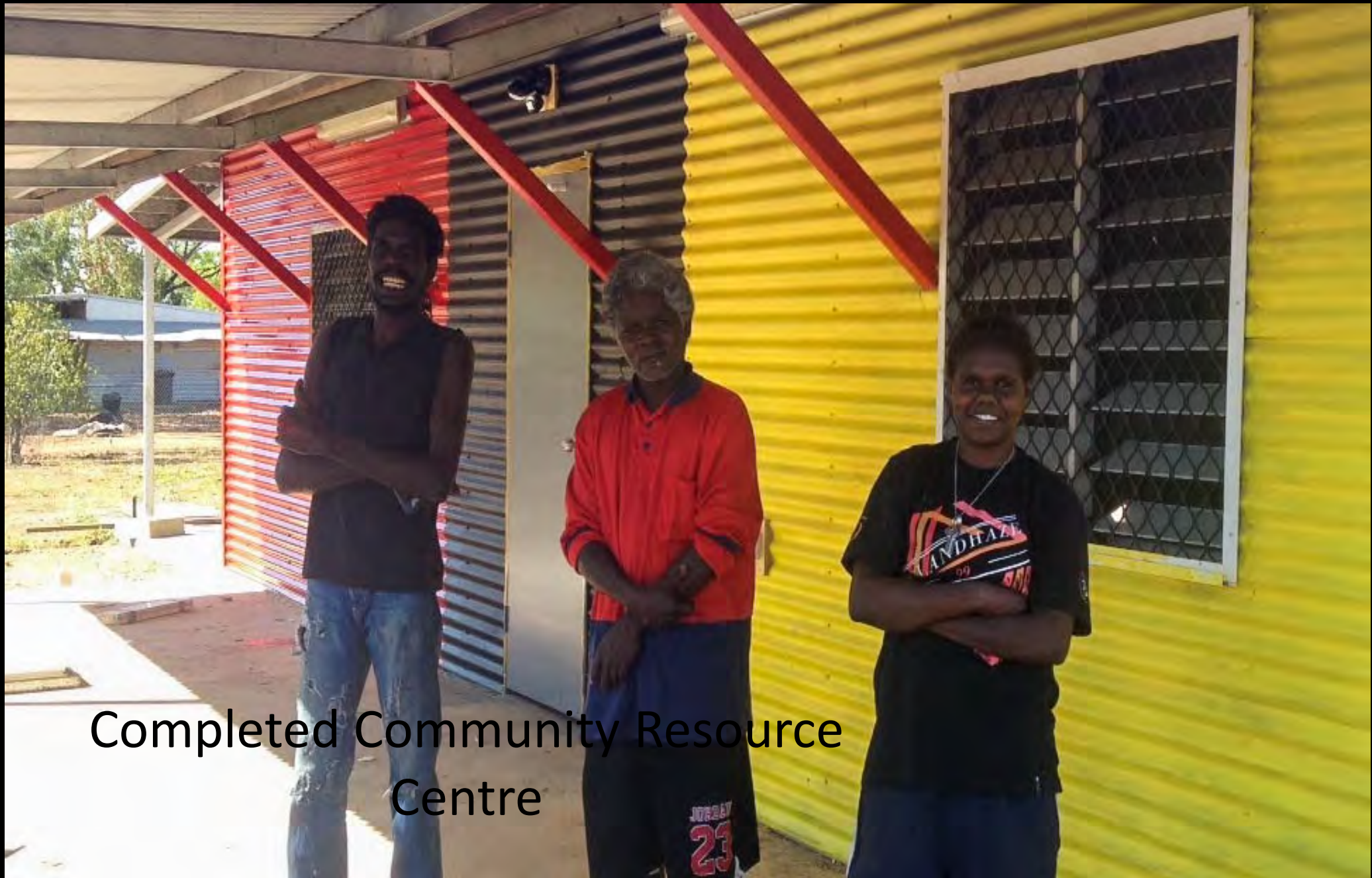
Completed Community Resource Centre