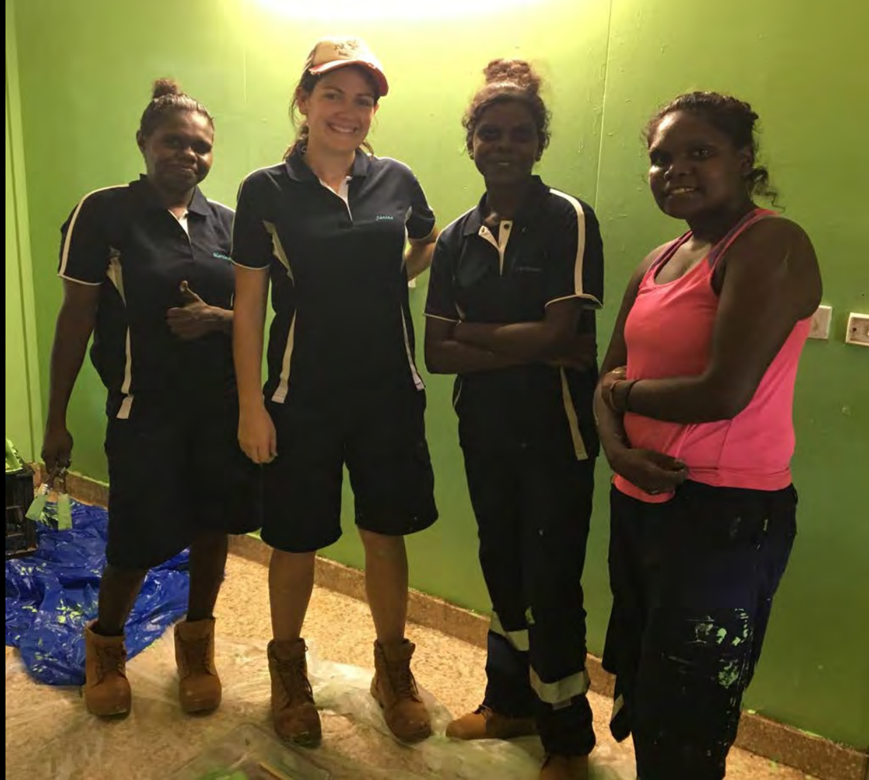
The Painting Project