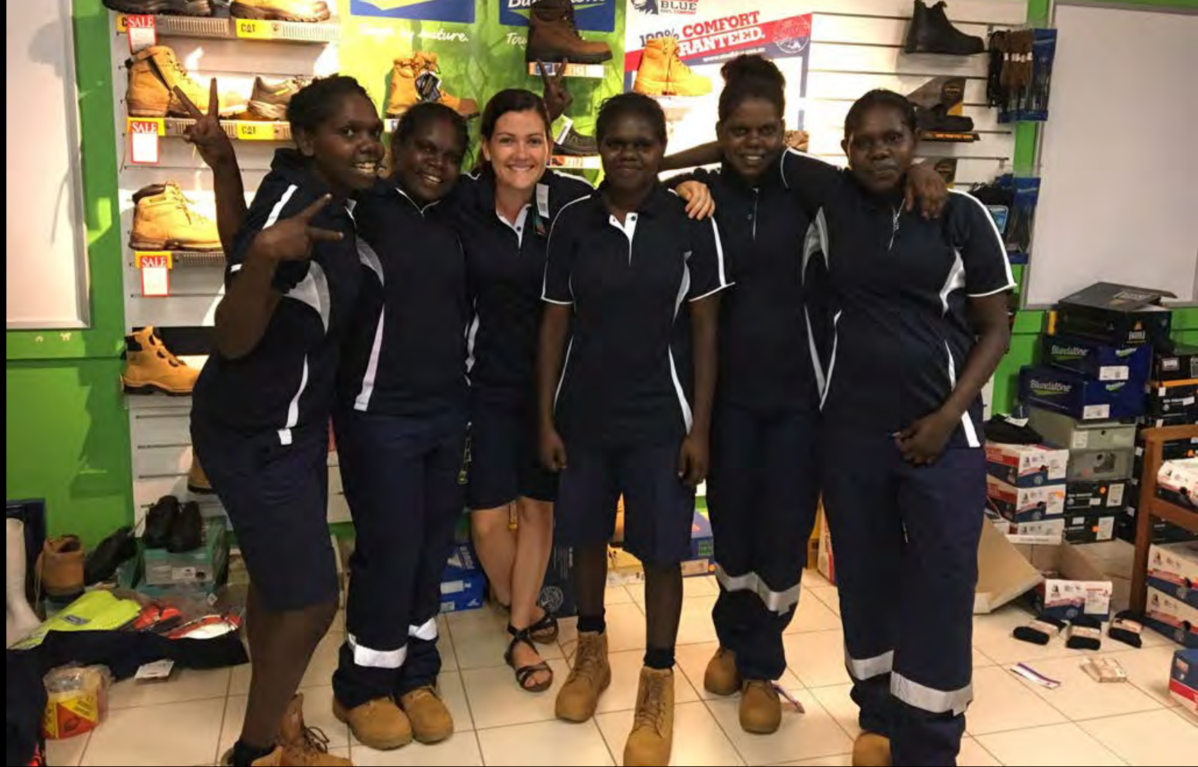
The YawkYawk Team!