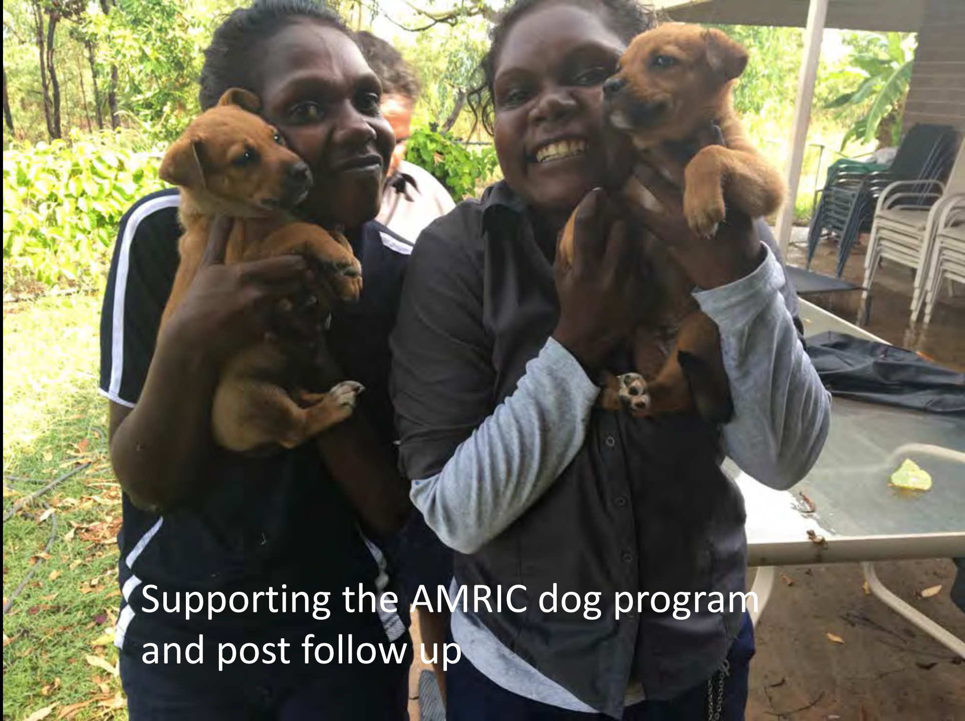
Supporting the AMRIC dog program and post follow up