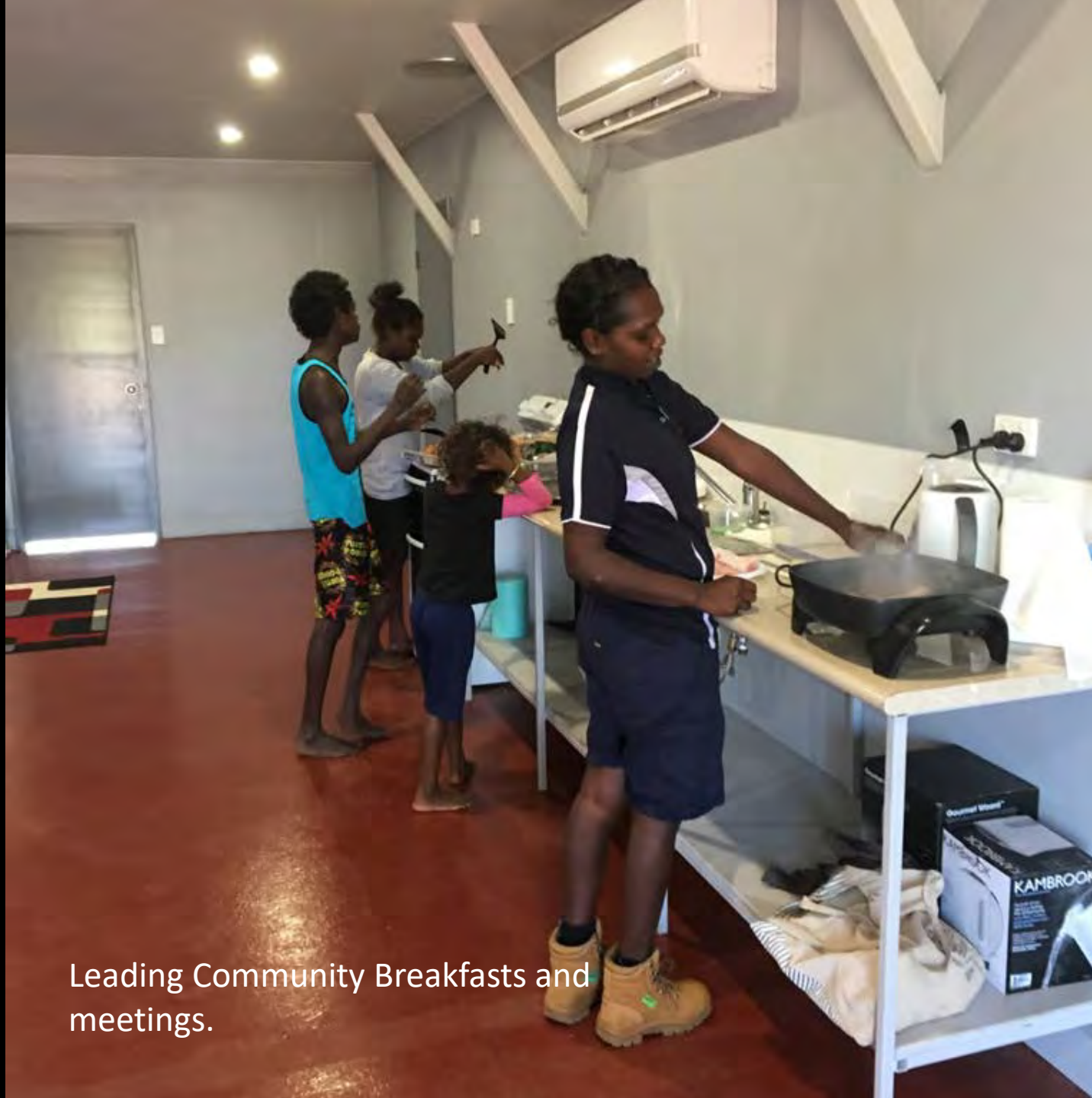
Leading Community Breakfasts and meetings.