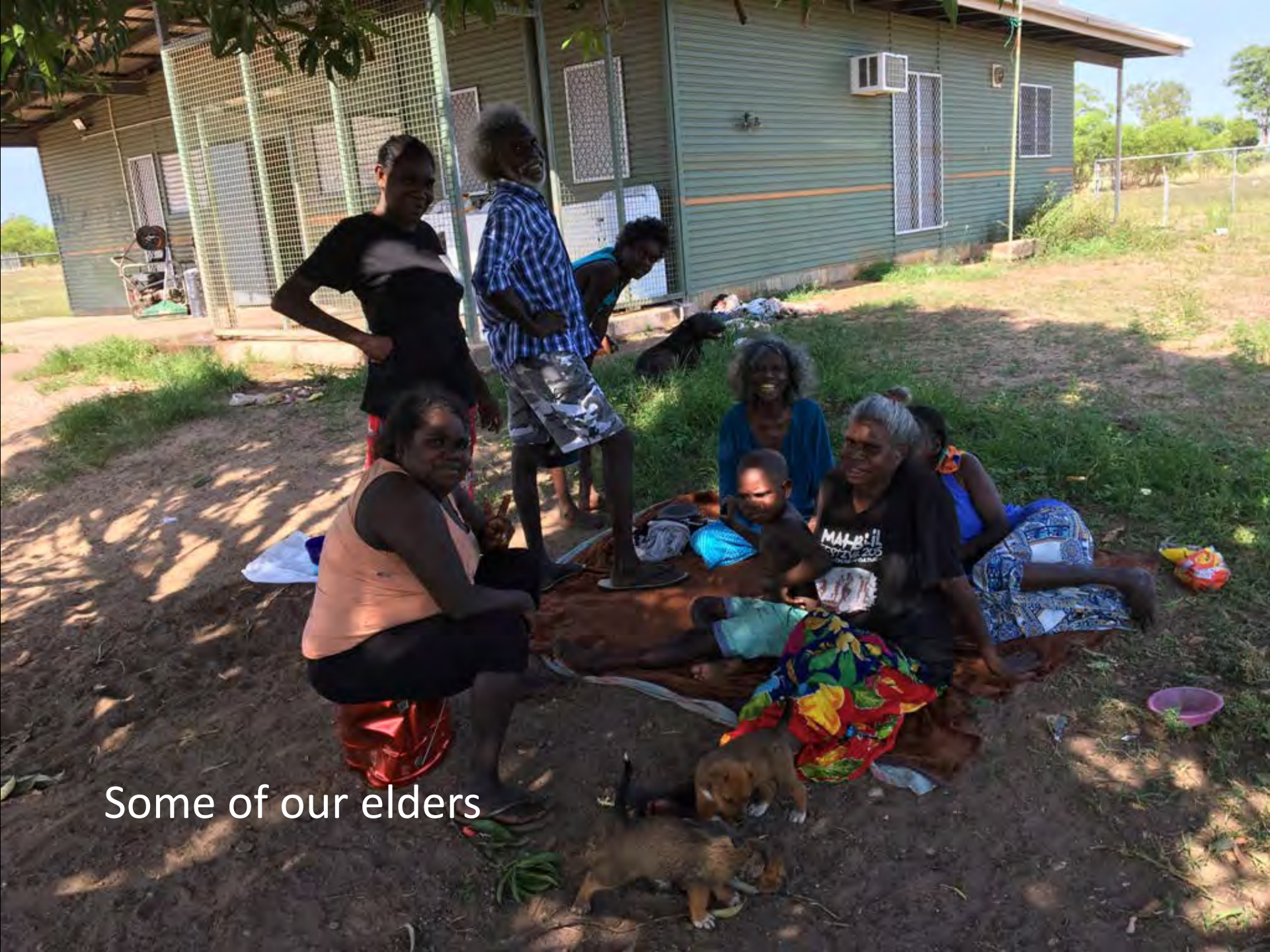
Some of our elders